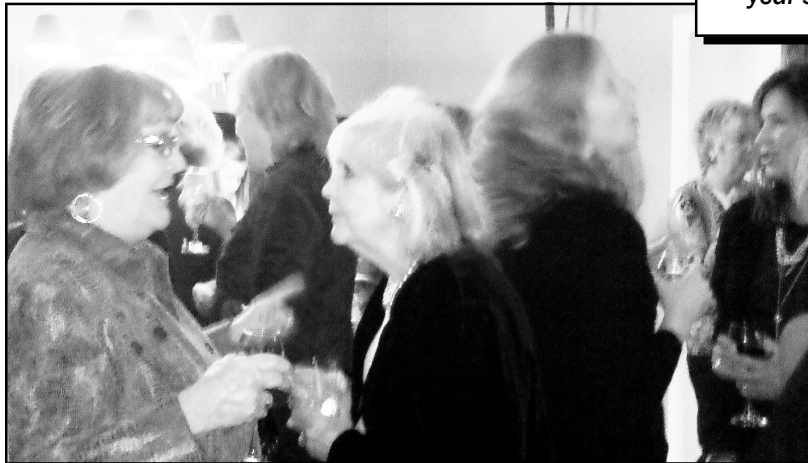
Left: Junior League members enjoying conversation and drinks at the Holiday Party.